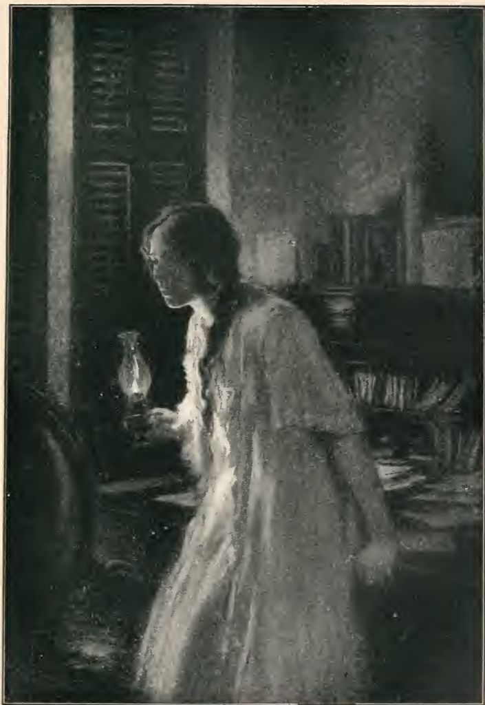
SHE WHEELED ABOUT AND STOOD, SWAYING WITH FRIGHT